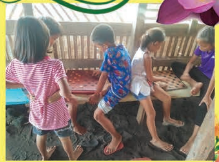
More activities for rainy days in the Subangan house