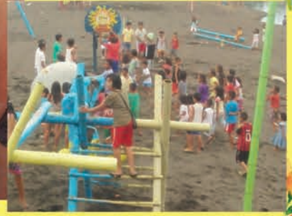
More and more kids are coming to the Subangan playground