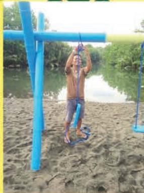
Fixing and replacing things after the storms