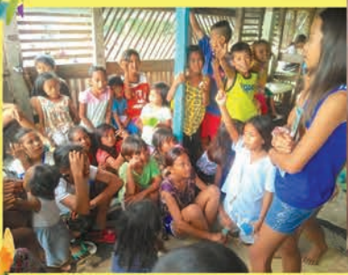
Daily bible teachings and feedings have resumed at the Subangan house