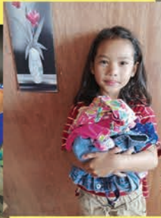
Donations of clothing and used laptops have arrived and are changing lives thanks to your love and generosity