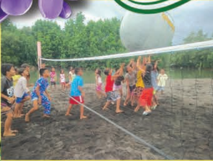
New games and supplies at Subangan