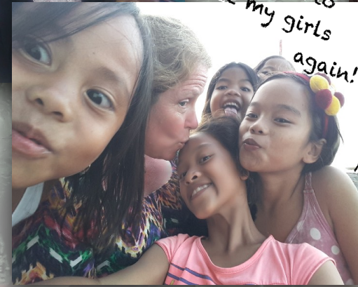
So good to see my girls again!