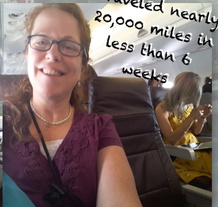
Traveled nearly 20,000 miles in less than 6 weeks