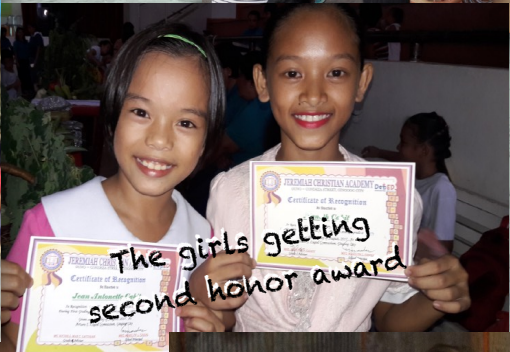
The girls getting second honor award