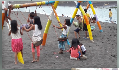
Subangan in full-swing