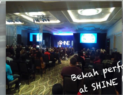
Bekah performing at SHINE (AMTC)