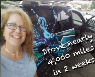
Drove nearly 4,000 miles in 2 weeks