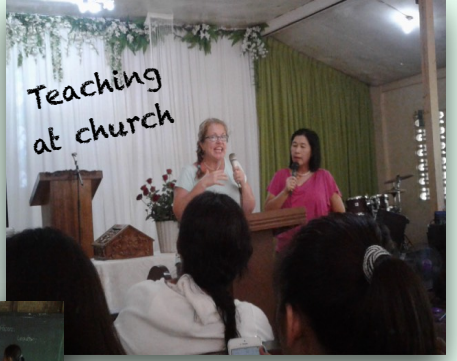
Teaching at church