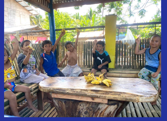
The start and finish of the waiting shed for mothers, strategically covering giant roots from the large tree that shades the playground