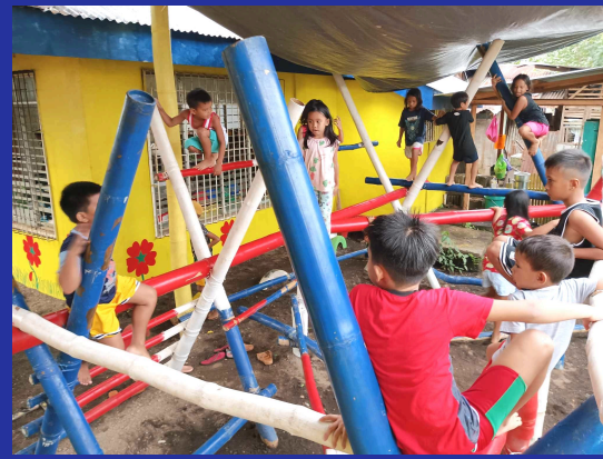
Great joy for the kids to climb laugh and play again