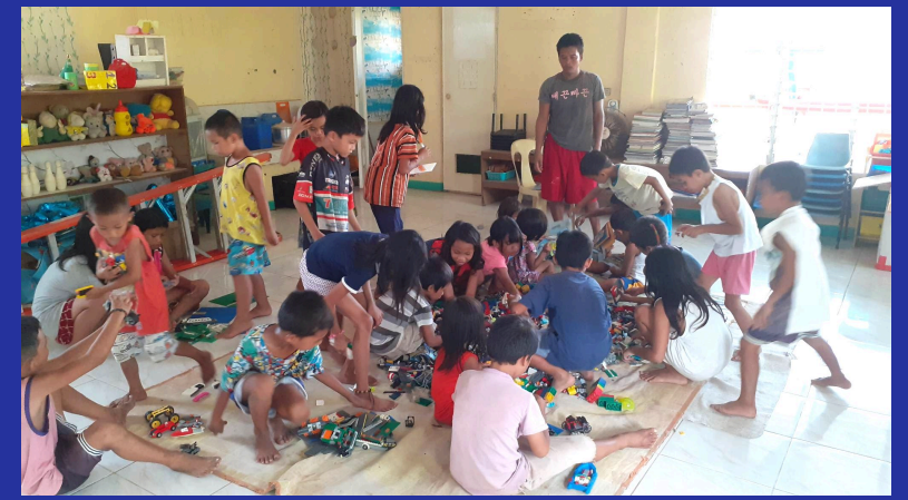
Inside the pre-school we get to use in the afternoons, lots of building with legos and blocks and checkers and chess