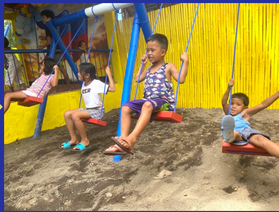
The start and finish of the new surrounding fence and swings