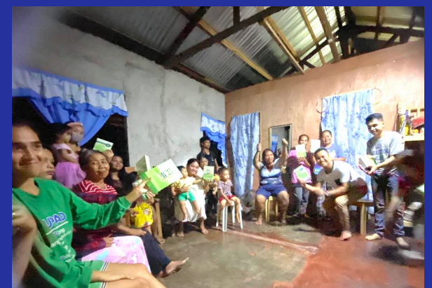
Giving out Bibles to all who lost theirs in the flood