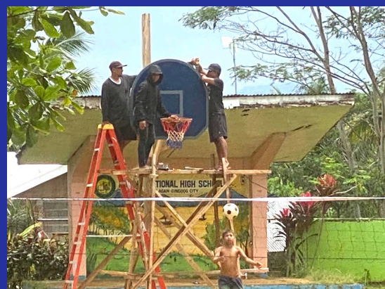
Putting up basketball hoops and volleyball nets for schools