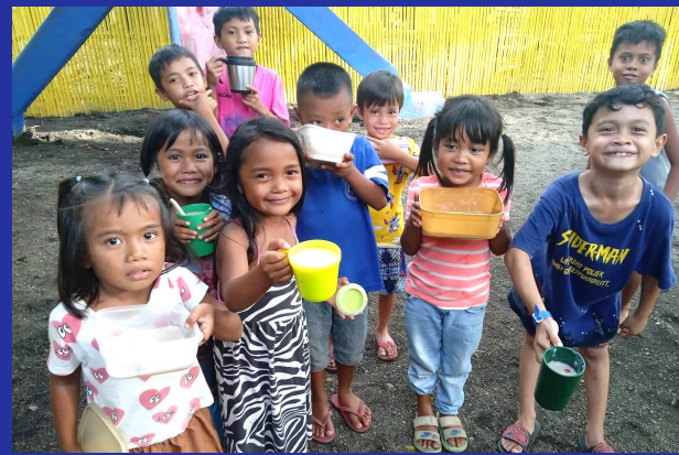
Nothing better than seeing the kids smile again