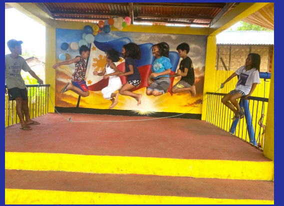
The start and finish of repairing and painting the stage