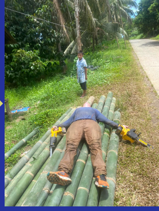
The start and finish of harvesting bamboo from the mountains