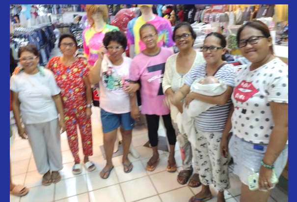
Supplying glasses so they can read their new Bibles