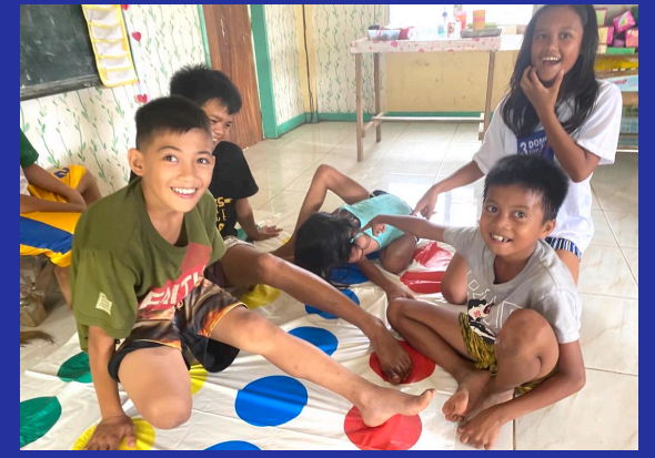
The kids enjoy playing twister for the first time