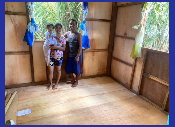
The start and finish of one of the houses rebuilt after the storm