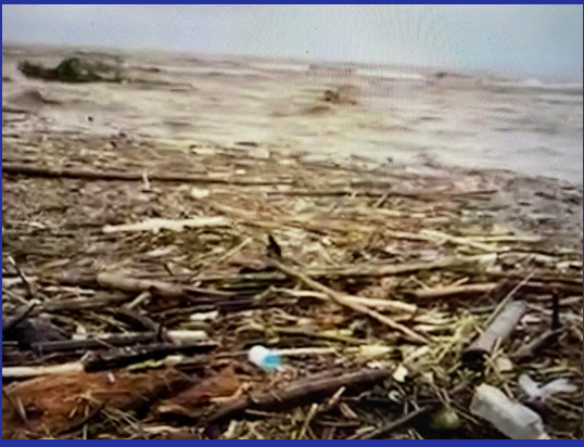
This is where the playground was for the last 12 years