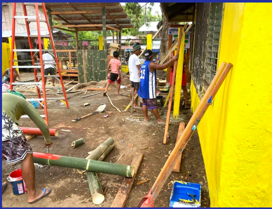
One month of all day work from sun up to sundown