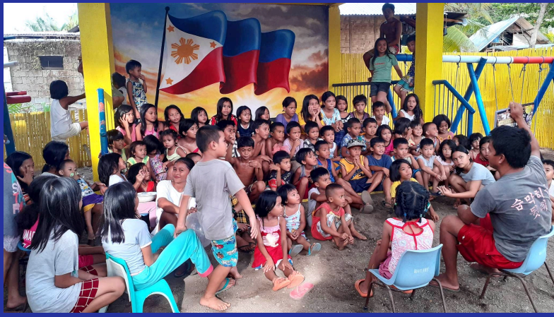
We have around 65 kids daily for feeding and Bible study

Many things went into the success of this trip and they start and end with our amazing God and your prayers and support. We have never done this much in this little of time.